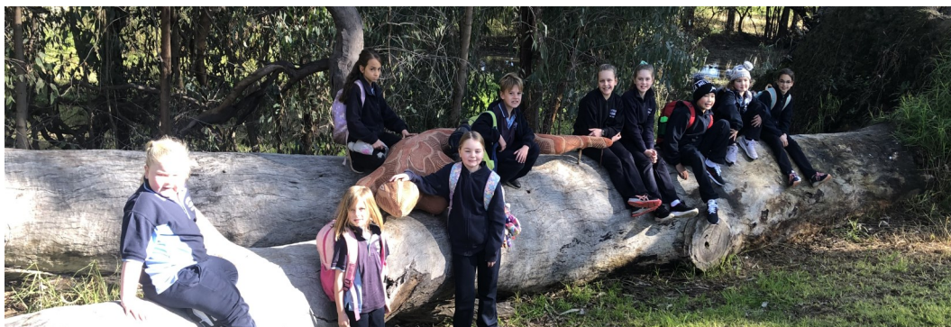
Students enjoyed the Yindyamarra Sculpture Walk as part of our NAIDOC Week celebrations.

Brocklesby Public School 65 Main Street, Brocklesby NSW 2642 T 02 6029 4272 F 02 6029 4239